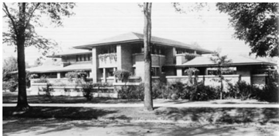
D. Martin House, 1902