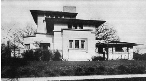
A. Fricke House, 1902

Identify the common features occurred in the 5 buildings designed by Wright. Sketch and label the features, make a note of which building they do appear. Please also use the back side of the paper.