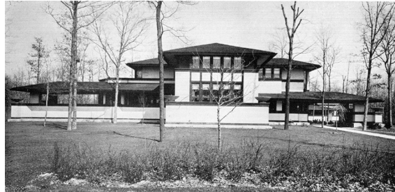
B. Willits House, 1902